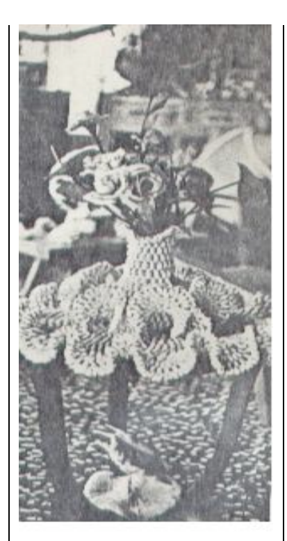
Some shell art decorating a Takaroan home.